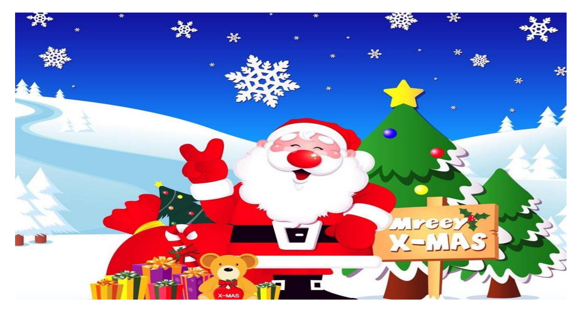
2. What do we have at Christmas? We have Christmas trees, lights and Santa.