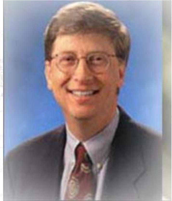
a computer programmer