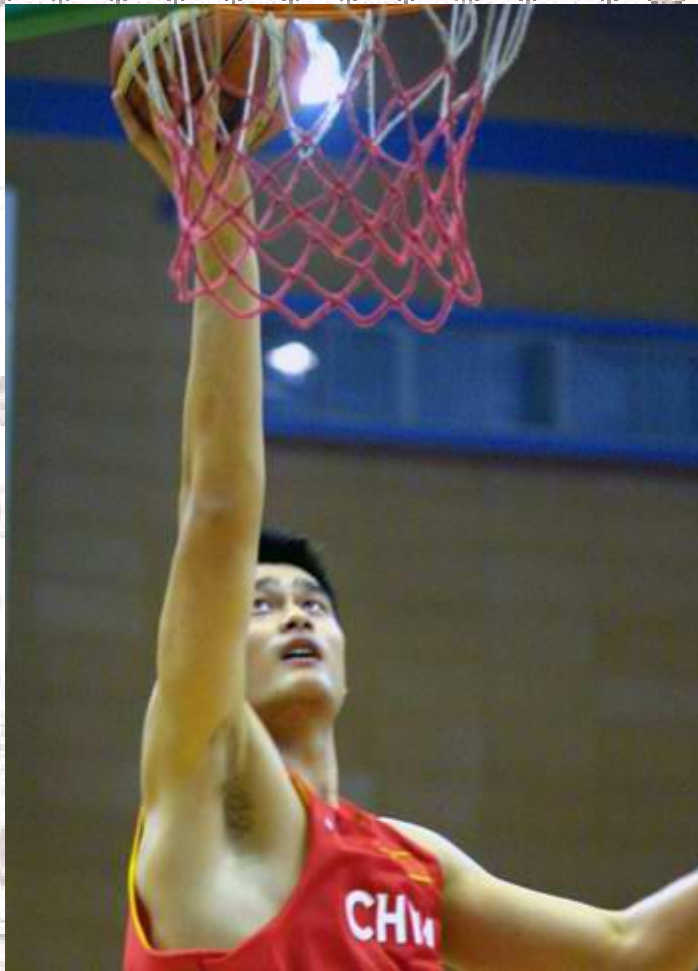
a professional basketball player