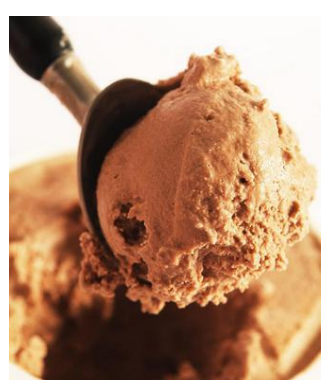
Put the bananas and icecream in the blender.