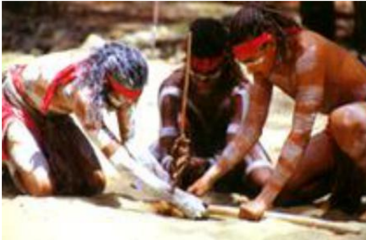
hunt for food