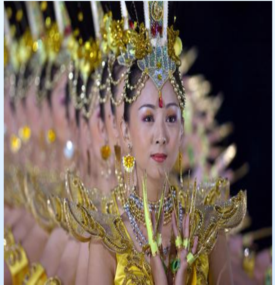
Thousands of Hands Kwan-yin.